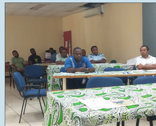
Participants from government and private sectors attending the CC Mitigation stakeholders' meeting.