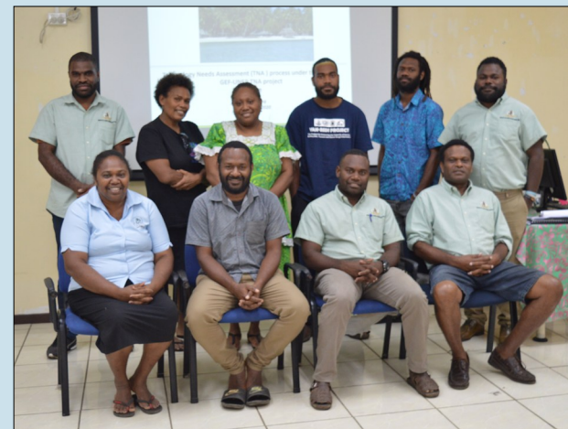
Members of the Climate Change Mitigation Technical Working Group during their first meeting in 2020