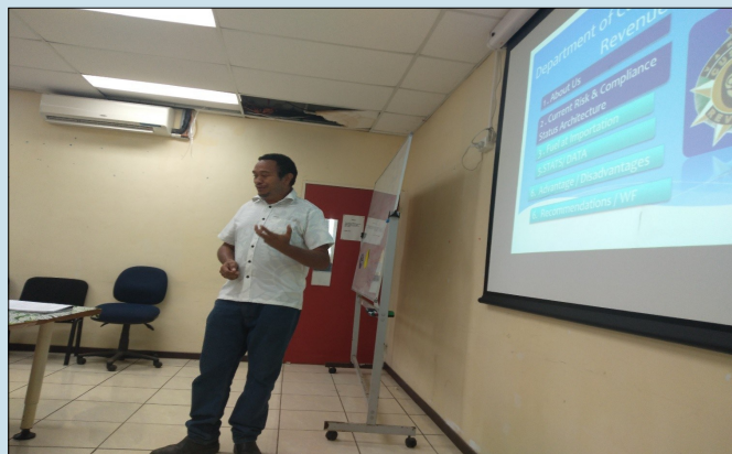
Above picture showed the group of stakeholders on the first workshop hosted