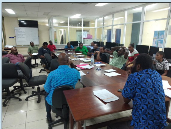
Above picture showed the group of stakeholders on the first workshop hosted at the NDMO Emergency Operation Center in 2019 that initiated and nominated sectors to the working group.

Nominations from each respective sector were sent to the Department of Climate Change and were finalised. A letter was developed and signed by the Minister for Climate Change to officially nominate members of the CCMTWG.